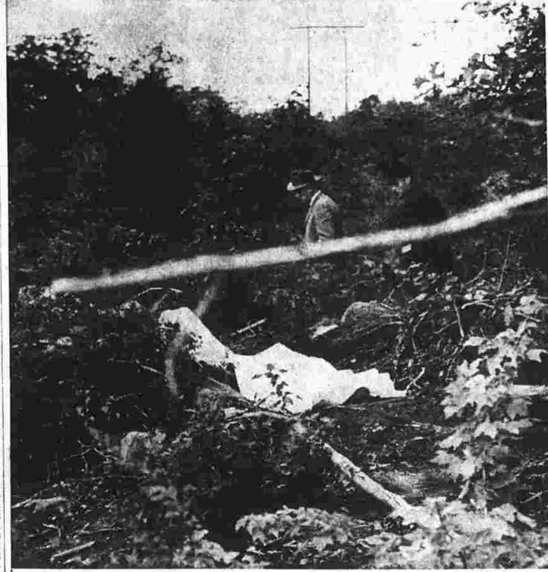
Girl's body lies in clearing near power line cut.