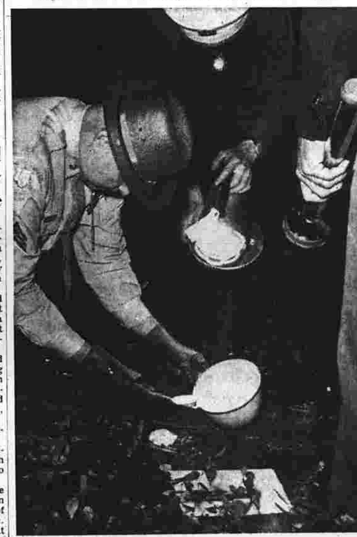
Police make plaster casts of footprints at the site.